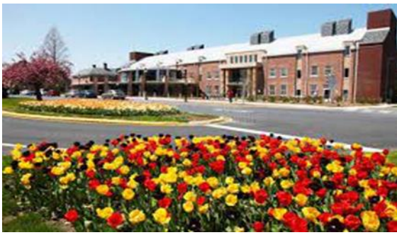
BEAUTIFUL TULIPS PLANTED BY THE CITY OF DOVER GROUNDS DEPT.